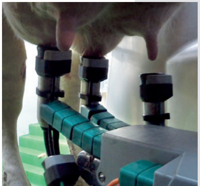
A TOF camera ensures precise attachment

A Time of Flight (TOF) camera detects the shape and position of the cow's teats, both visually and dimensionally. The milking control unit calculates the ideal position to automatically apply the teat cups, placing them precisely below the teats. This TOF principle ensures an accurate attachment in a matter of seconds.